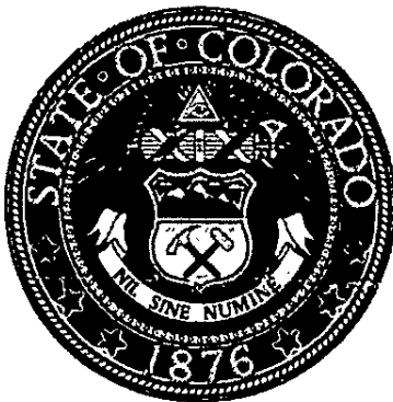
Secretary of State of the State of Colorado

I have affixed hereto the Great Seal of the State of Colorado and duly generated, executed, and issued this official certificate at Denver, Colorado on 08/12/2016 @ 11:43:11 in accordance with applicable law. This certificate is assigned Confirmation Number 9785263