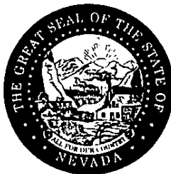
BARBARA K. CEGAVSKE Secretary of State

Electronic Certificate Certificate Number: C20160720-1911 You may verify this electronic certificate online at http://www.nvsos.gov/