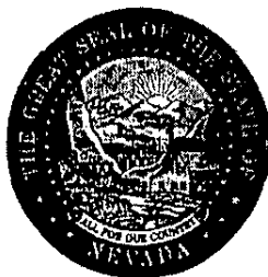
BARBARA K. CEGAVSKE Secretary of State

Electronic Certificate Certificate Number: C20160630-0094 You may verify this electronic certificate online at http://www.nvsos.gov/