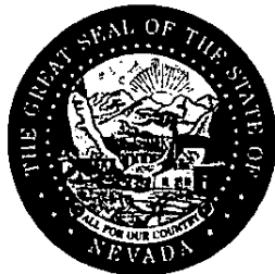
BARBARA K. CEGAVSKE Secretary of State

Electronic Certificate Certificate Number: C20160307-0700 You may verify this electronic certificate online at http://www.nvsos.gov/