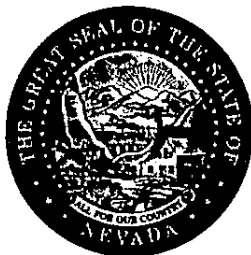
BARBARA K. CEGAVSKE Secretary of State

Electronic Certificate Certificate Number: C20151220-0034 You may verify this electronic certificate online at http://www.nvsos.gov/