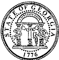
Brian P. Kemp Secretary of State

Docket Number : 12167857 Date Inc/Auth/Filed : 08/19/2015 Jurisdiction : Georgia Print Date : 9/22/2015 Form Number : 211