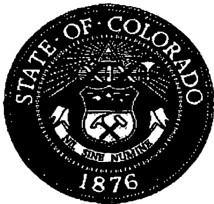
Secretary of State of the State of Colorado

I have affixed hereto the Great Seal of the State of Colorado and duly generated, executed, authenticated, issued, delivered and communicated this official certificate at Denver, Colorado on 09/16/2015 @ 17:09:20 pursuant to and in accordance with applicable law. This certificate is assigned Confirmation Number 9307700.