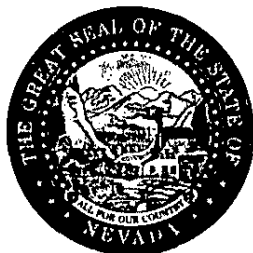
BARBARA K. CEGAVSKE Secretary of State

Electronic Certificate Certificate Number: C20150816-0100 You may verify this electronic certificate online at http://www.nvsos.gov/