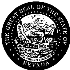
BARBARA K. CEGAVSKE Secretary of State

Electronic Certificate Certificate Number: C20150819-0860 You may verify this electronic certificate online at http://www.nvsos.gov/