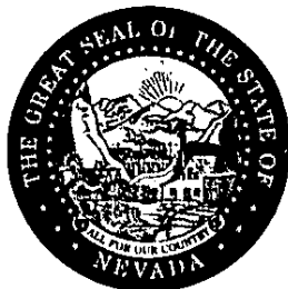
BARBARA K. CEGAVSKE Secretary of State

Electronic Certificate Certificate Number: C20150812-0743 You may verify this electronic certificate online at http://www.nvsos.gov/