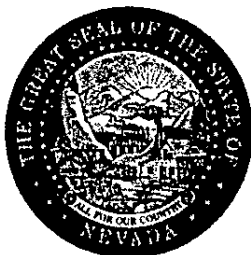
BARBARA K. CEGAVSKE Secretary of State

Electronic Certificate Certificate Number: C20150120-1589 You may verify this electronic certificate online at http://www.nvsos.gov/