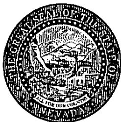
ROSS MILLER Secretary of State

Electronic Certificate Certificate Number: C20140823-0391 You may verify this electronic certificate online at http://www.nvsos.gov/