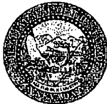
ROSS MILLER Secretary of State

Electronic Certificate Certificate Number: C20140206-2824 You may verify this electronic certificate online at http://www.nvsos.gov/