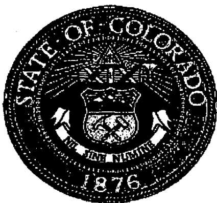
Secretary of State of the State of Colorado

I have affixed hereto the Great Seal of the State of Colorado and duly generated, executed, authenticated, issued, delivered and communicated this official certificate at Denver, Colorado on 08/13/2013 @ 07:53:07 pursuant to and in accordance with applicable law. This certificate is assigned Confirmation Number 8613786.