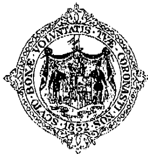
Paul B. Anderson Charter Division

301 West Preston Street, Baltimore, Maryland 21201 Telephone Balto. Metro (410) 767-1340 / Outside Balto. Metro (888) 246-5941 MRS (Maryland Relay Service) (800) 735-2258 TT/Voice Fax (410) 333-7097