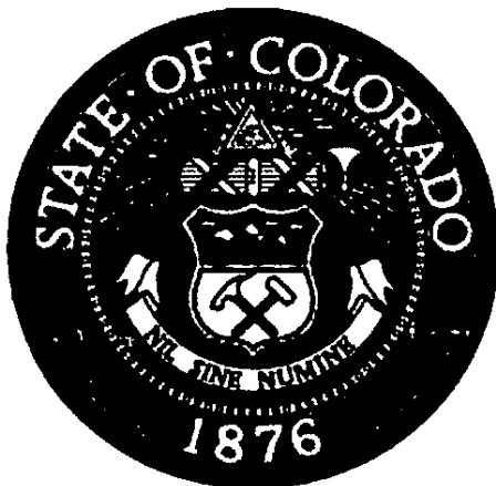
Secretary of State of the State of Colorado

I have affixed hereto the Great Seal of the State of Colorado and duly generated, executed, authenticated, issued, delivered and communicated this official certificate at Denver, Colorado on 05/21/2013 @ 15:02:21 pursuant to and in accordance with applicable law. This certificate is assigned Confirmation Number 8546290.