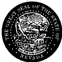
ROSS MILLER Secretary of State

Electronic Certificate Certificate Number: C20130306-0331 You may verify this electronic certificate online at http://www.nvsos.gov/