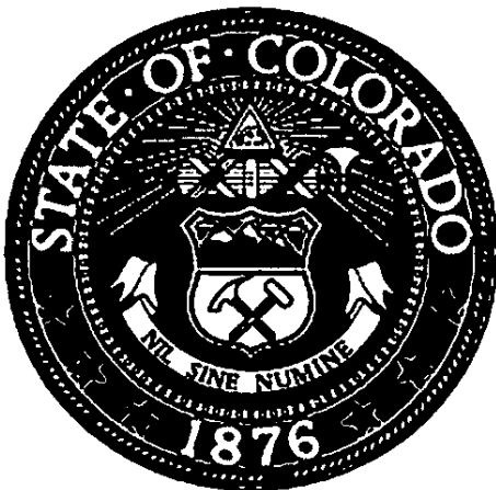
Secretary of State of the State of Colorado

I have affixed hereto the Great Seal of the State of Colorado and duly generated, executed, authenticated, issued, delivered and communicated this official certificate at Denver, Colorado on 12/05/2012 @ 14:54:35 pursuant to and in accordance with applicable law. This certificate is assigned Confirmation Number 8402169.