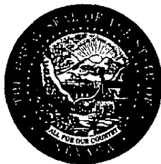
ROSS MILLER Secretary of State

Electronic Certificate Certificate Number: C20120611-1326 You may verify this electronic certificate online at http://www.nvsos.gov/