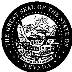
ROSS MILLER Secretary of State

Electronic Certificate Certificate Number: C20120408-0053 You may verify this electronic certificate online at http://www.nvsos.gov/