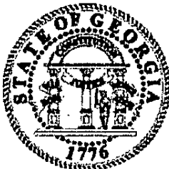
Brian P. Kemp Secretary of State

WITNESS my hand and official seal in the City of Atlanta and the State of Georgia on April 26, 2011