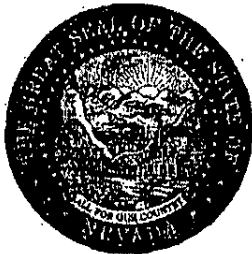
ROSS MILLER Secretary of State

Electronic Certificate Certificate Number: C20110901-1885 You may verify this electronic certificate online at http://www.nvsos.gov/