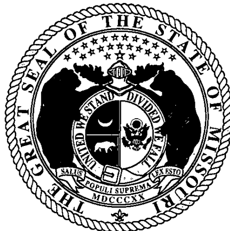
Secretary of State

Certification Number: 13371080-1 Reference: