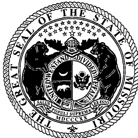
Secretary of State

Certification Number: 12485488-1 Reference: Verify this certificate online at https://www.sos.mo.gov/businessentity/soskb/verify.asp