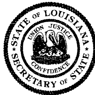
Secretary of State 36558235K

In testimony whereof, I have hereunto set My hand and caused the Seal of my Office To be affixed at the City of Baton Rouge on, August 31, 2009