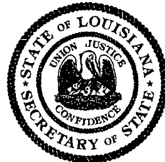
Secretary of State 35237438K

In testimony whereof, I have hereunto set My hand and caused the Seal of my Office To be affixed at the City of Baton Rouge on, September 1, 2009