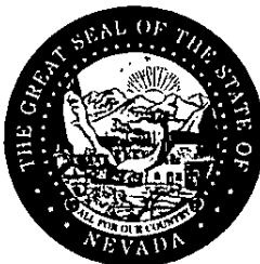
ROSS MILLER Secretary of State

Electronic Certificate Certificate Number: C20090807-0156 You may verify this electronic certificate online at http://www.nvsos.gov/