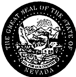
ROSS MILLER Secretary of State

Electronic Certificate Certificate Number: C20090521-2288 You may verify this electronic certificate online at http://www.nvsos.gov/