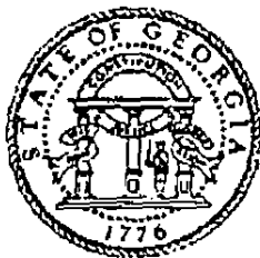
Karen C Handel Secretary of State

This certificate is issued pursuant to Title 14 of the Official Code of Georgia Annotated and is prima-facie evidence that said entity is in existence or is authorized to transact business in this state.