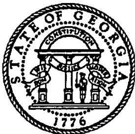
Karen C Handel Secretary of State

This certificate is issued pursuant to Title 14 of the Official Code of Georgia Annotated and is prima-facie evidence that said entity is in existence or is authorized to transact business in this state.