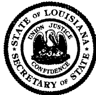
Secretary of State 35130201K