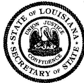
Secretary of State 36705862K