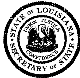
Secretary of State 36832431K