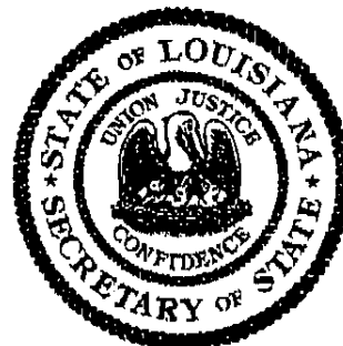
Secretary of State 36161752K