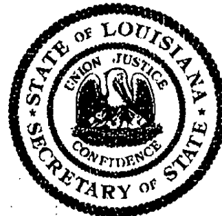
Secretary of State 36760033K