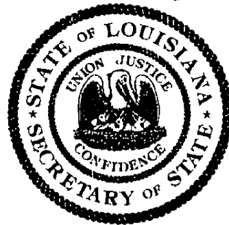
Secretary of State 34725981K

In testimony whereof, I have hereunto set My hand and caused the Seal of my Office To be affixed at the City of Baton Rouge on, February 11, 2009