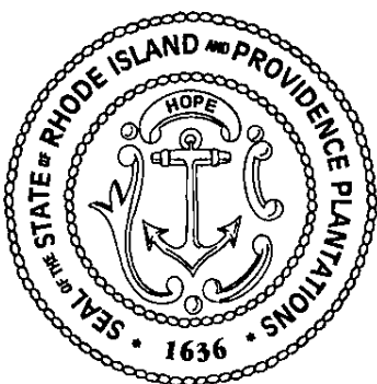
Secretary of State

SIGNED AND SEALED this twenty-sixth day of January, A.D. 2009.