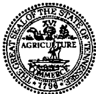
TRE HARGETT SECRETARY OF STATE

RECEIPT NUMBER: 00004520620 ACCOUNT NUMBER: 00235330