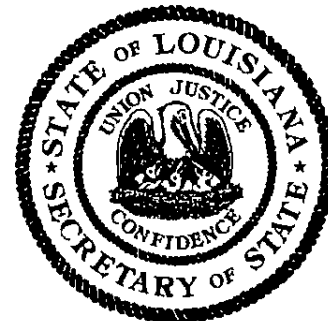
Secretary of State 34481379K

In testimony whereof, I have hereunto set My hand and caused the Seal of my Office To be affixed at the City of Baton Rouge on, December 18, 2008