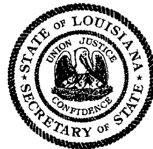
Secretary of State 36920413K