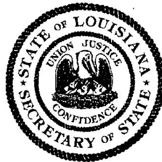
Secretary of State 36834341K

In testimony whereof, I have hereunto set My hand and caused the Seal of my Office To be affixed at the City of Baton Rouge on, October 20, 2008