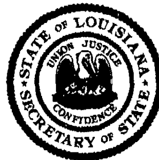
Secretary of State 36604918K