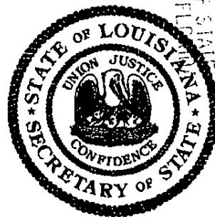
Secretary of State 34869449K