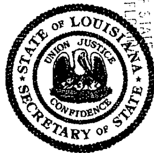
Secretary of State 34869449K

In testimony whereof, I have hereunto set My hand and caused the Seal of my Office To be affixed at the City of Baton Rouge on, August 5, 2008