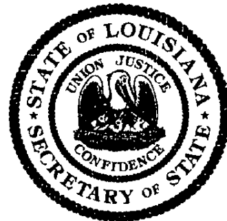
Secretary of State 36269999K