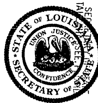
Secretary of State 36699755K