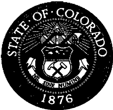
Secretary of State of the State of Colorado

I have affixed hereto the Great Seal of the State of Colorado and duly generated, executed, authenticated, issued, delivered and communicated this official certificate at Denver, Colorado on 05/05/2008 @ 08:51:41 pursuant to and in accordance with applicable law. This certificate is assigned Confirmation Number 7077187 .