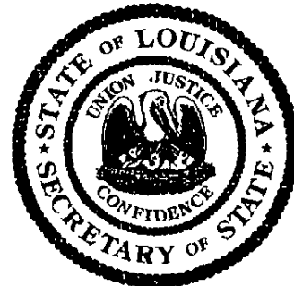
Secretary of State 36641606K