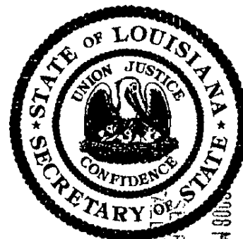
Secretary of State 35634821K