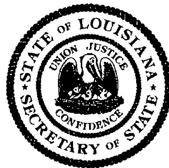
Secretary of State 36479828K

In testimony whereof, I have hereunto set My hand and caused the Seal of my Office To be affixed at the City of Baton Rouge on, February 20, 2008