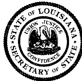
Secretary of State 35439801K

In testimony whereof, I have hereunto set My hand and caused the Seal of my Office To be affixed at the City of Baton Rouge on, January 29, 2008